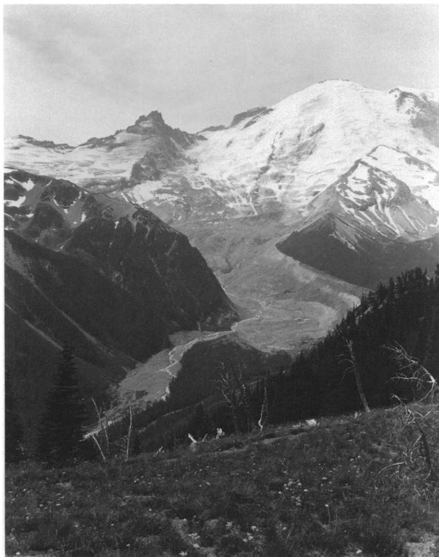
Figure 3. The valley of White River draining the flanks of Mt. Rainier contains numerous examples of landform influences on vegetation and disturbance patterns.

The influence of landforms on patterns of soil, vegetation, animals, and aquatic ecosystems across a landscape contribute to developing and maintaining a patchwork ecosystem. This influence occurs through the effects of landforms on environmental gradients (class 1 and 2 effects) and regulation by landform of the patterns and frequency of the disturbance (class 3 and 4 effects). To date, the full spec-